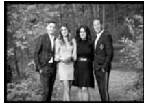
The Vescio Family

Vescio Funeral Home - Woodbridge Chapel 8101 Weston Road 905-850-3332 vesciofuneralhome.com Elegant Five Star Funeral Services, For the Very Best Price, Guaranteed.