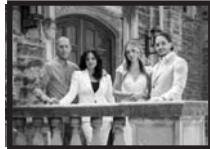
The Vescio Family